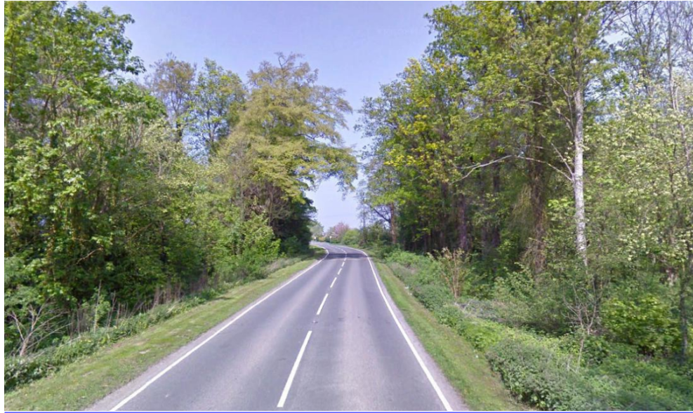
Image 1: An example of a hop-over formed of tall vegetation across the existing B1122